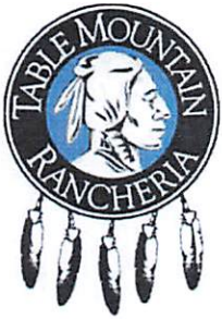
TABLE MOUNTAIN RANCHERIA TRIBAL GOVERNMENT OFFICE